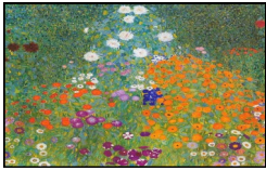
Flower Garden by Gustav Klimt